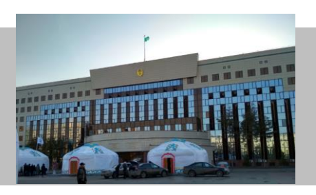
Public Healthcare Department of Nur-Sultan city